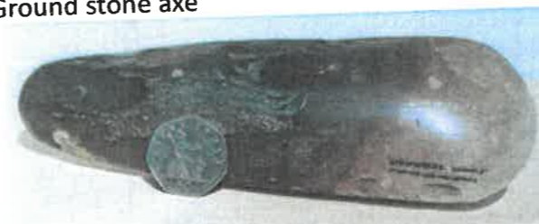
Ground stone axe

4000 to 2000 BCE Neolithic to Early Bronze Age